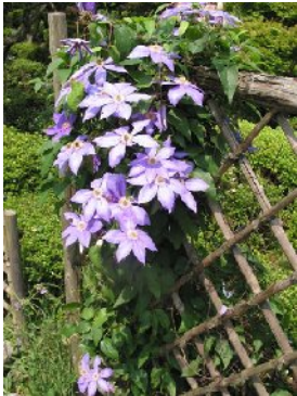
Clematis are among the most decorative of the flowering vines. There is great variety in flower form, color, bloom season, foliage effect and plant height.

Communities can engage in cleanup programs to remove trash or graffiti; participating in programs that improve the appearance, safety and use of public spaces; conducting their own patrols to identify neighborhood problems by joining an organized neighborhood watch program.