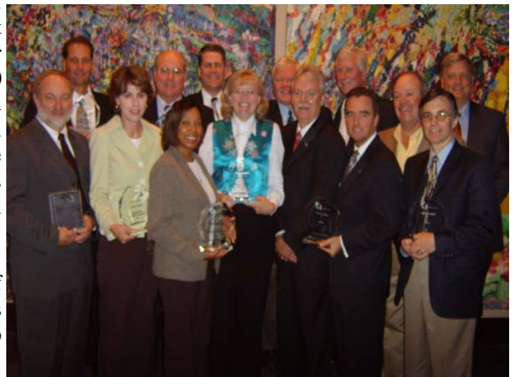
AMWA 2008 Platinum and Gold Award Winners

This is a great achievement for the Department of Utilities and the City of Norfolk. This award signifies that Norfolk's Department of Utilities is one of the top 11 large, metropolitan water agencies in the Nation.