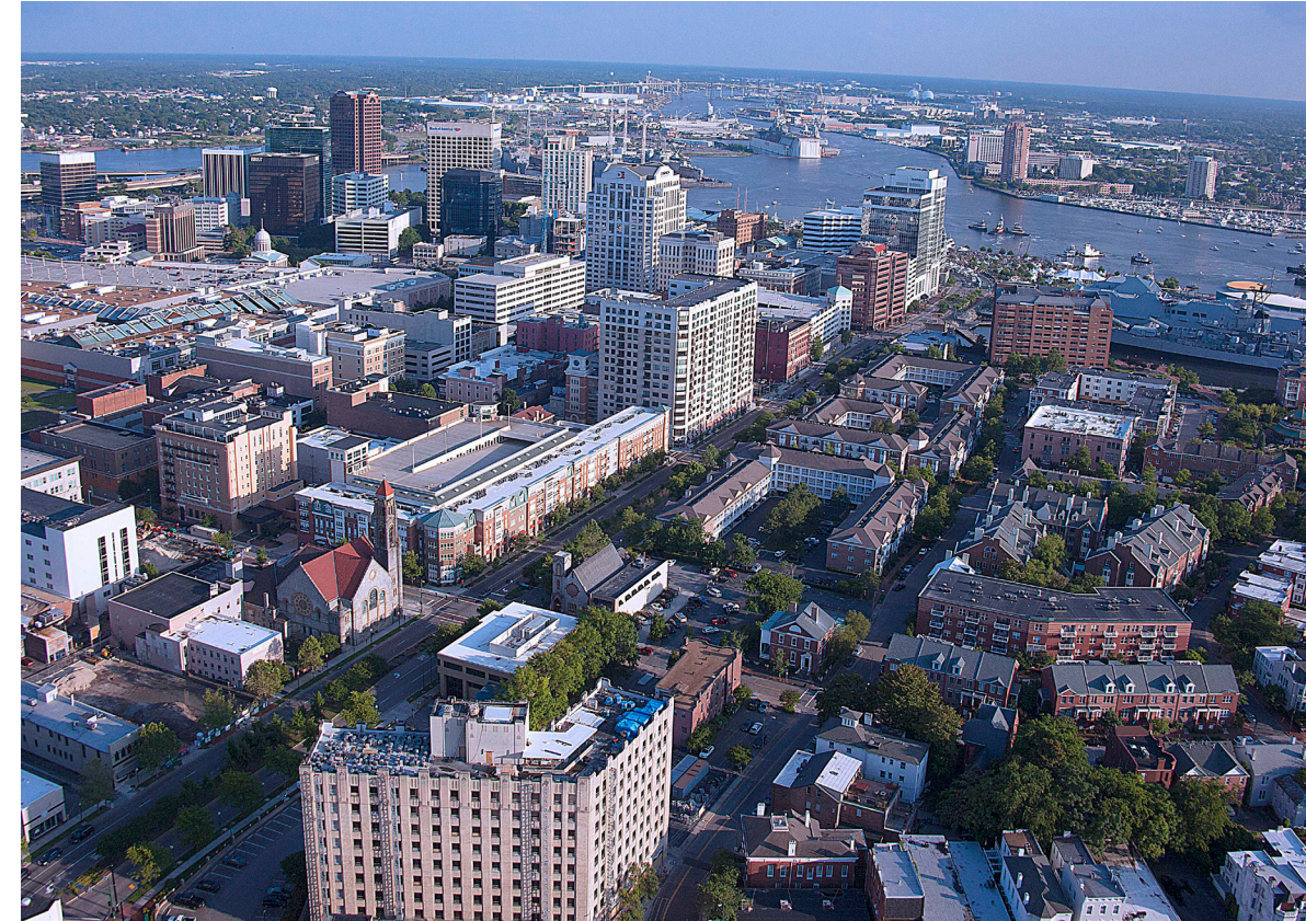
(City of Norfolk)

Norfolk's future rests on its ability to attract, retain, and encourage families to come here, stay here, and put down deep roots into their local community.