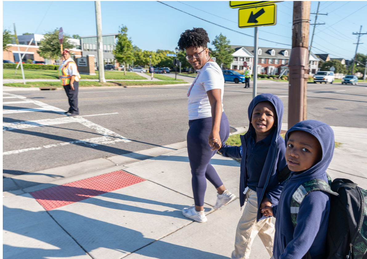
(City of Norfolk)

Norfolk is a place where families of all types want to come here, stay here, and take root, feeling welcome and finding support for their needs.