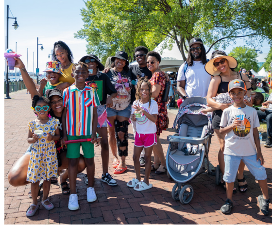
(City of Norfolk)

Across all our discussions, several cross-cutting themes consistently emerged in the evolving vision for the city's future. These themes chart the course for what this Plan needs to accomplish , and they act as underlying assumptions woven throughout the rest of the document.