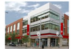
MIXED USE WITH BIG BOX