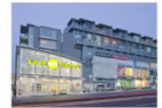
RESIDENTIAL OVER BIG BOX