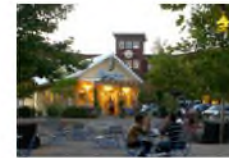
PARK WITH SEATING