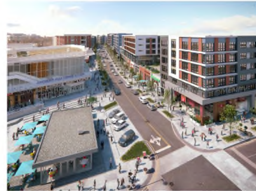
MIXED USE DEVELOPMENT WITH PEDESTRIAN PLAZA