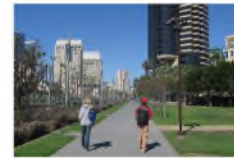
PATHWAY NEXT TO RR TRACKS