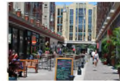
PLAZA WITH CAFE DINING