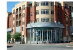
RESIDENTIAL OVER GROCERY