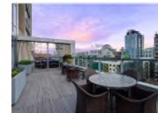
GARAGE DECK AMENITY