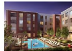
GARAGE DECK AMENITY