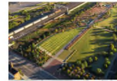
PARK NEXT TO RR TRACKS