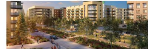
NEIGHBORHOOD PARK SURROUNDED BY MIXED USE DEVELOPMENT