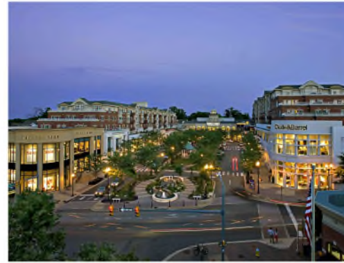
MIXED USE DEVELOPMENT DESIGN AROUND PARK AND AMENITIES