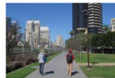
PATHWAY NEXT TO RR TRACKS