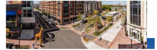
WIDE SIDEWALK WITH EVENT SPACE, SEATING AND PUBLIC ART