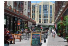
PLAZA WITH CAFE DINING