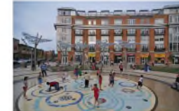
PLAY FOUNTAINS AND PUBLIC ART