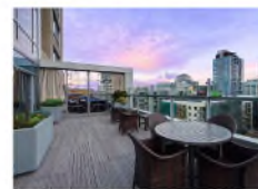
GARAGE DECK AMENITY