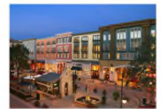
RESIDENTIAL OVER RESTAURANTS