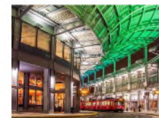
LIGHT RAIL STATION INTEGRATED INTO DEVELOPMENT