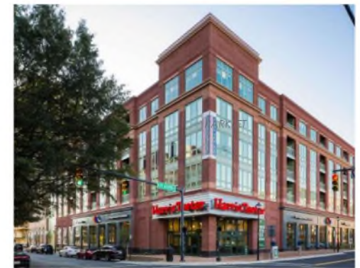
RESIDENTIAL ABOVE GROCERY STORE