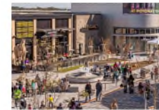
SEATING AND DINING