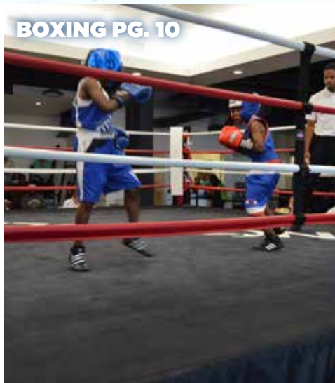
BOXING PG. 10