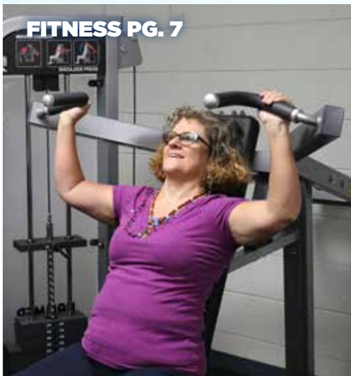
FITNESS PG. 7