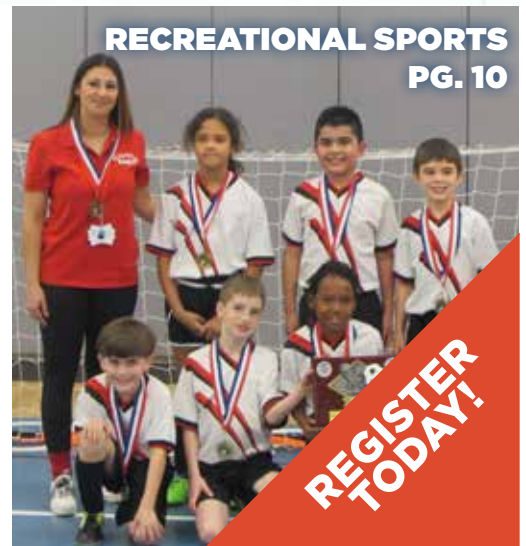
RECREATIONAL SPORTS PG. 10