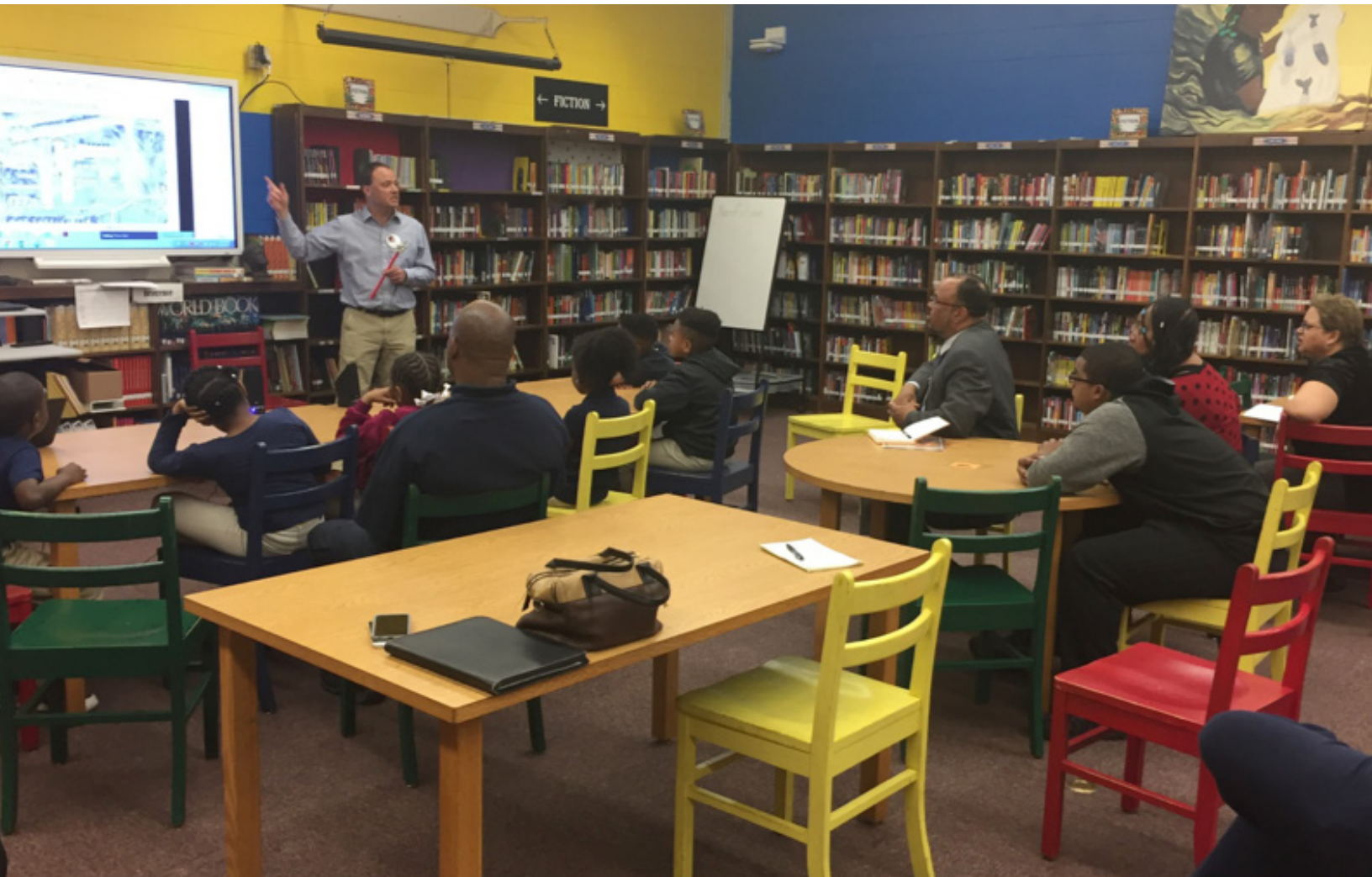
Ohio Creek Project Community Meeting