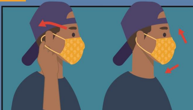
PLACE OVER NOSE AND MOUTH