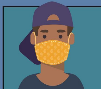
MAKE SURE YOU CAN BREATHE EASILY