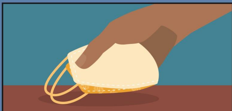
PUT ASIDE FOR WASHING