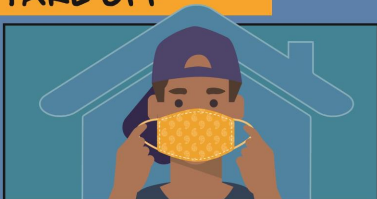
TAKE OFF YOUR FACE COVERING