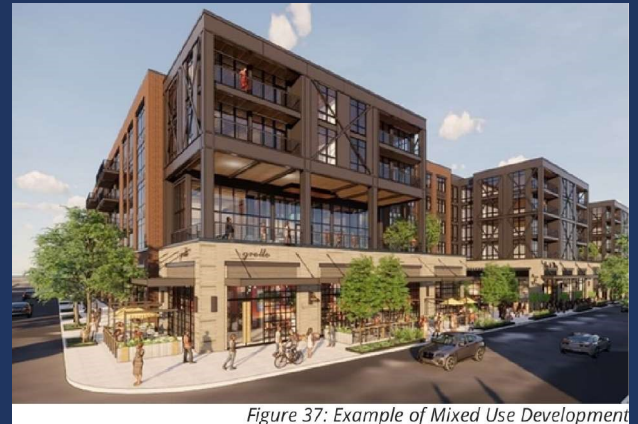
Figure 37: Example of Mixed Use Development